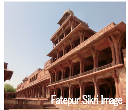
Fatepur Sikri Image