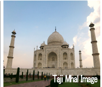
Taji Mhal Image