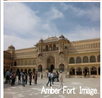
Amber Fort Image